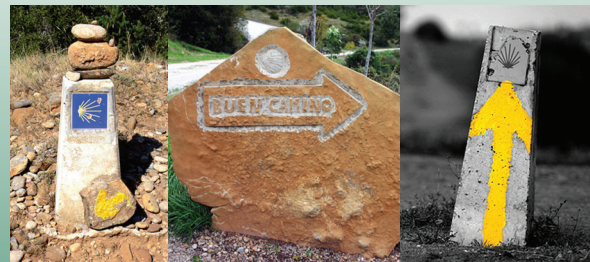
El Camino (The Way) is marked by arrows, shells, or sign posts, that function like a compass, directing pilgrims to their ultimate destination